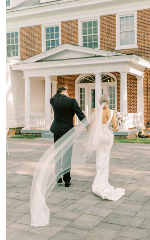
0: : . . . . .