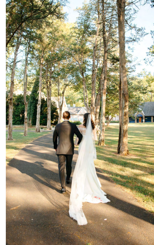
O'matin land in a